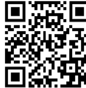
Tax Withholding (Landing page for Federal, State & Local)