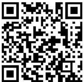
Life At Ford

Someone is here to help you! You can call or chat with the Payroll Helpdesk to help answer your questions.