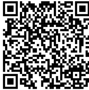
Tax Withholding Resources Life at Ford Landing Page with Links