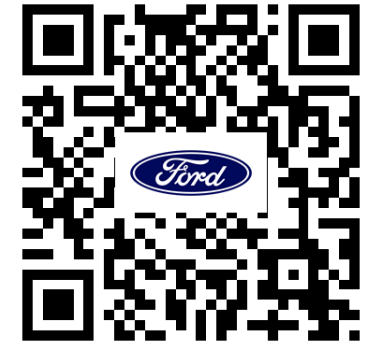
Credit Union Deductions

(Phone Number, Online Chat, Submit a Ticket)