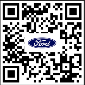
Hourly Payslip Job Aids