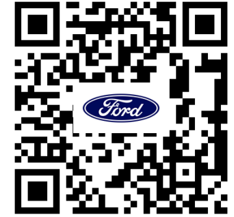
Ford Interest Advantage (FIA)