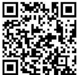
Life At Ford