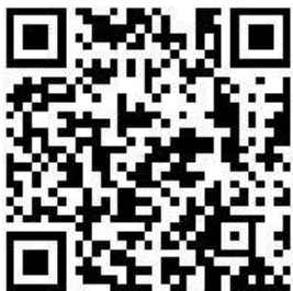
Life At Ford

Someone is here to help you! You can call or chat with the Payroll Helpdesk to help answer your questions.