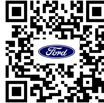
SUB Application Form 2062