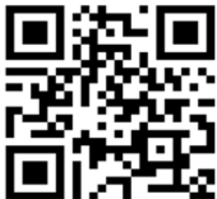
Blue Oval Now