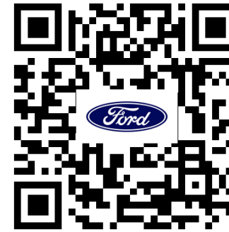
Payroll Help Desk Details

(Phone Number, Online Chat, Submit a Ticket)