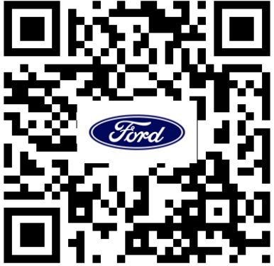
HCM Payslip Landing Page